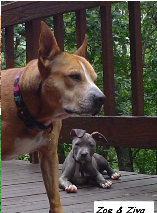
Zoe & Ziva